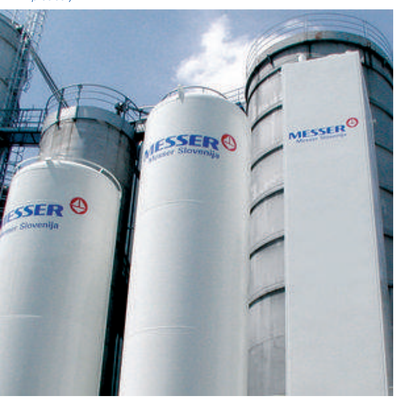
On-site installation is carried out by qualified specialists.

The advantages of CryoGAN generators like these ones at Julon in Slovenia are that they offer a continuous supply and enable costs to be calculated precisely.